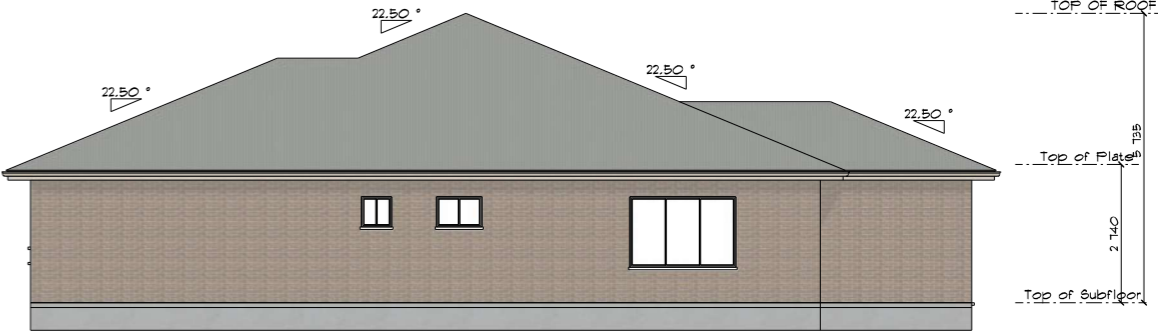
WEST ELEVATION SCALE: 1:150