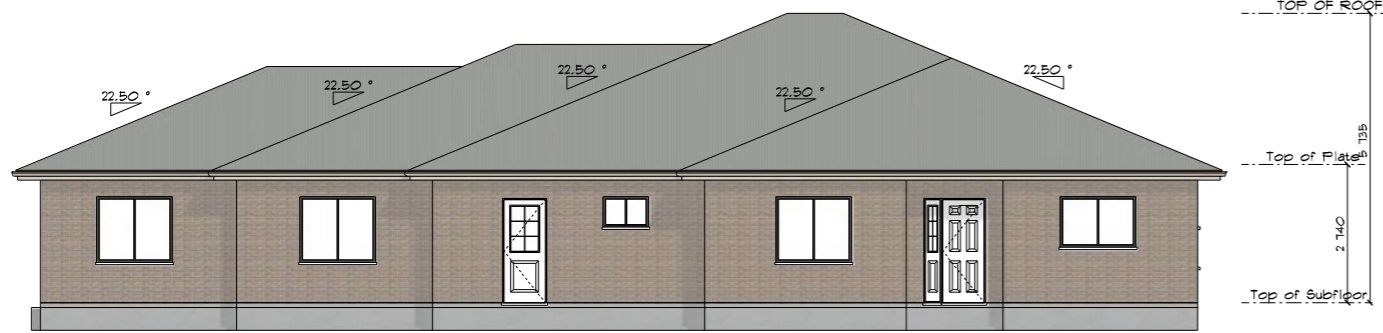
NORTH ELEVATION SCALE: 1:150